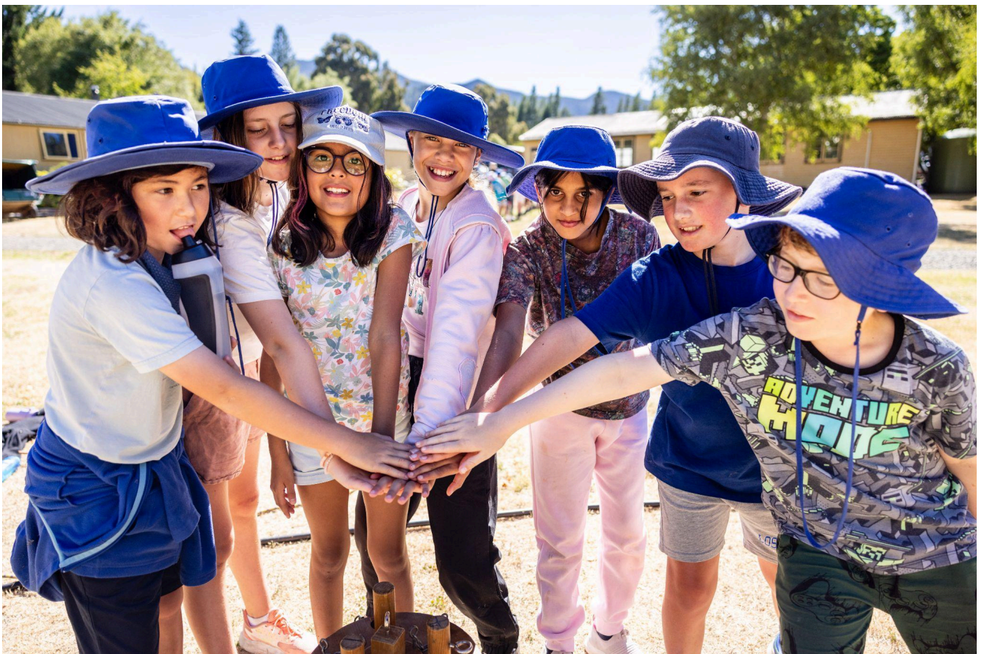
Image: Senior Camp 2024

We look forward to working in partnership with you while your child grows at Ilam School.